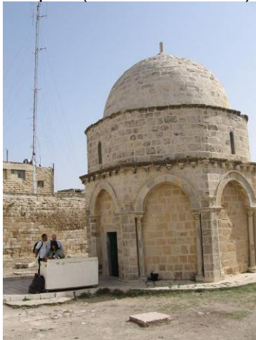
Church of the Ascension

One of my favourite places in Jerusalem is Bethany and the little stone Chapel of the Ascension. (It was first built in 390AD, became a mosque, and the present chapel was rebuilt in 1150AD.) Though not a very impressive structure, it is for me a mystical place and I find it particularly moving to think that Jesus might have stood there with his disciples and looked over the city in the distance. He then reminded them of the Great Commission to make disciples (Matthew 28:19-20) beginning from