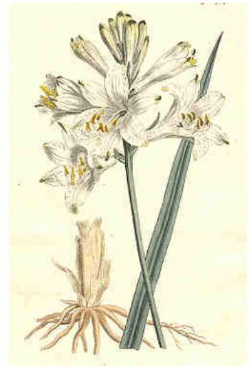
St Bruno's Lily

When I look back at those 30 days they were certainly filled with great wonderment and discovery. I think I'll close here by simply saying that if that description of the exercises of St Ignatius tugs at your heart you just might want to check out St. Beuno's.