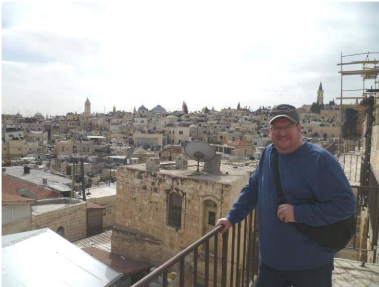
Looking out over Jerusalem.

In the 24 th chapter of Luke's gospel there is the wonderful post-resurrection story of Cleopas and another disciple of Jesus walking on the road from Jerusalem to Emmaus. They are joined on the road by a stranger who walks and talks with them. Of course, we all know the stranger is invited at the end of the day to stay and dine with them. When he takes, blesses, breaks and distributes the bread, the eyes of Cleopas and the other disciple are opened and they realize that they have been in the company of the resurrected Jesus. Their fatigue is forgotten and they begin the journey all the way back to Jerusalem so that they can tell the other followers the good news.