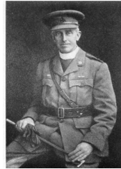
Canon Frederic George Scott, WWI veteran.

The Anglican Military Ordinariate of Canada reflects faithfully the role of the Chaplain Branch of the Canadian Forces by reflecting on our story, history and traditions that mark in a decisive fashion the presence and role of the Anglican Communion (its clergy and people) in the life and mission of the Canadian Forces.