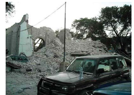
The Episcopal Cathédrale Sainte Trinité, Port-au-Prince, before and after the earthquake