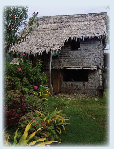
Leaf house on Mlaita, Solomon Islands