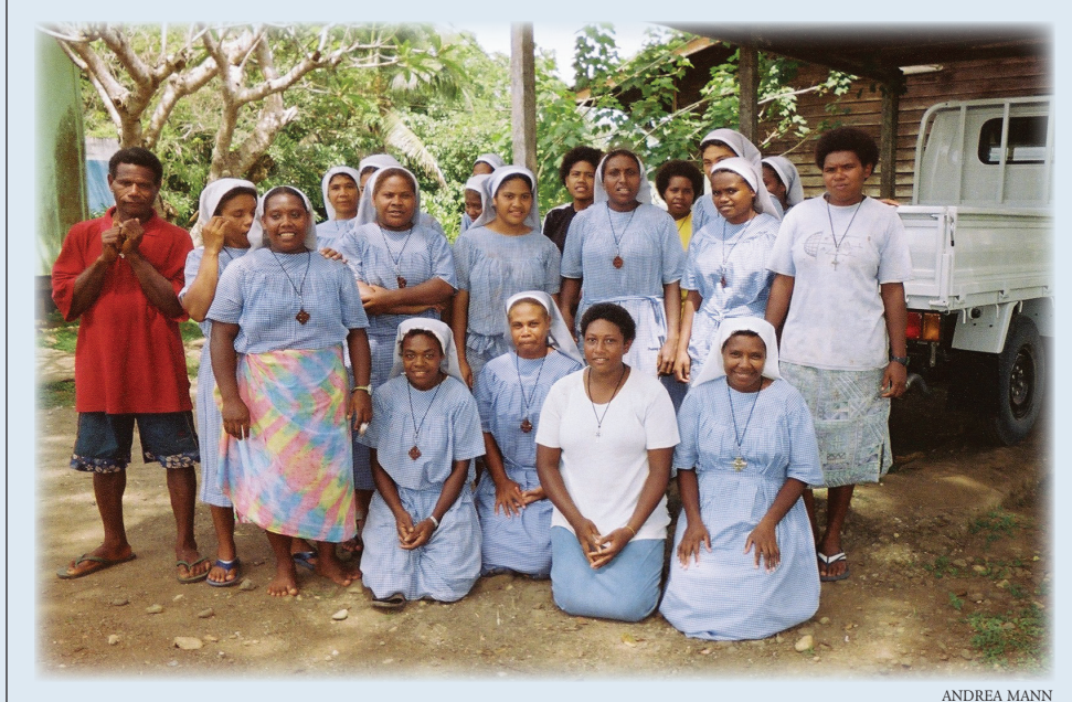
Sisters of the Church, Solomon Islands

This is real evangelism that goes on largely unsung, un-financed, undocumented. These evangelists walk the roads with bare feet and no money. These are evangelists whom people can welcome in their homes like returning sons or daughters, who will share whatever food there is and who will sleep on a mat and help hoe the garden, catch the fish or repair the roof. These are the evangelists who will come whenever they are called to pray for the sick, solve a village dispute, calm down a husband who is drunk. And when they visit, they bring a sense of goodness, the sense that something better is possible. ◊