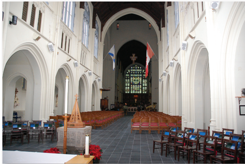
Interior of the Cathedral Church of All Saints, Halifax