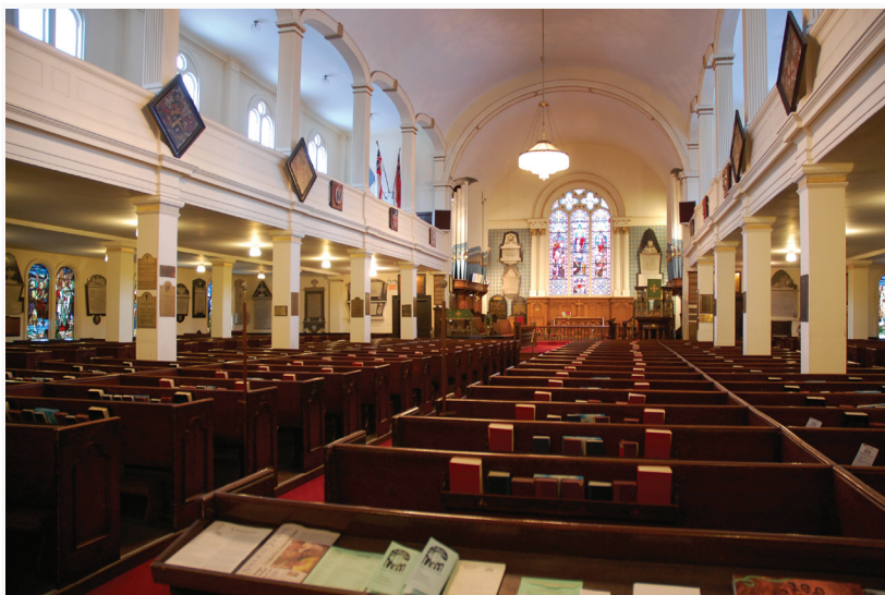
Interior of St. Paul's Church, Halifax