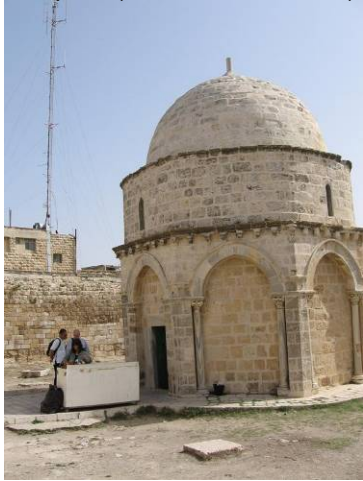
Church of the Ascension

One of my favourite places in Jerusalem is Bethany and the little stone Chapel of the Ascension. (It was first built in 390AD, became a mosque, and the present chapel was rebuilt in 1150AD.) Though not a very impressive structure, it is for me a mystical place and I find it particularly moving to think that Jesus might have stood there with his disciples and looked over the city in the distance. He then reminded them of the Great Commission to make disciples (Matthew 28:19-20) beginning from