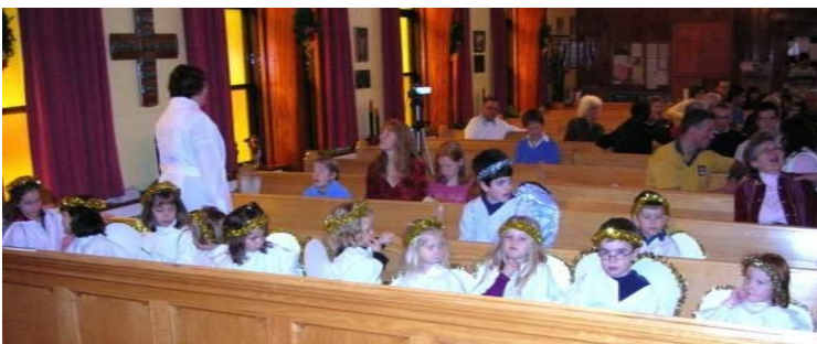
Young angels assemble at St Mark's Chapel, 14 Wing Greenwood