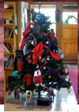
Petawawa Chapel Mitten Tree

Bulletin/Volume 9, No 4 Advent & Christmas 2012/ Epiphany 2013