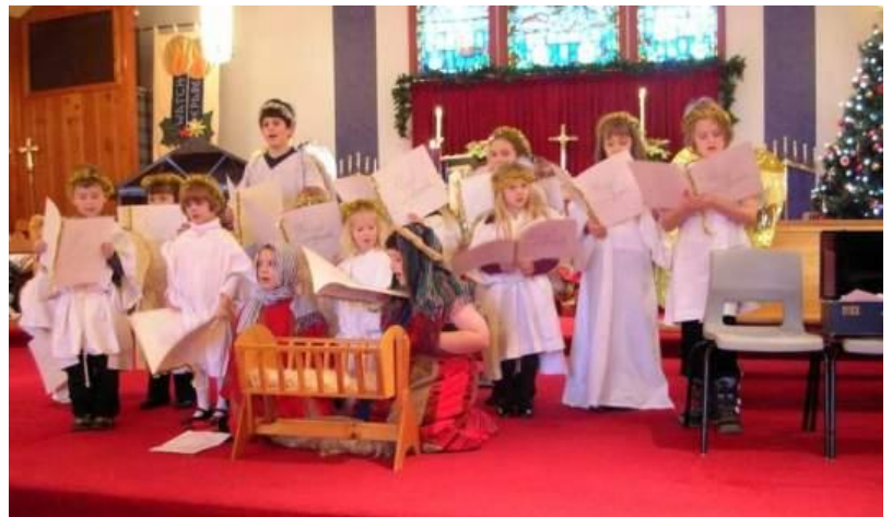
Beautiful, faith-filled and energetic Christmas Pageant during Advent at St Mark’s Chapel, 14 Wing, Greenwood in December 2006