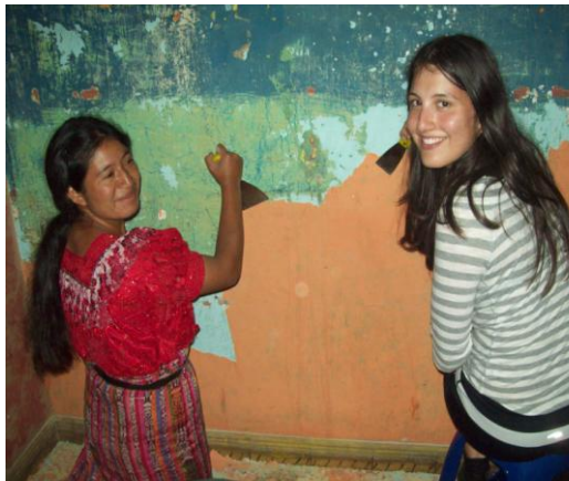
A community project takes shape at Peace House.