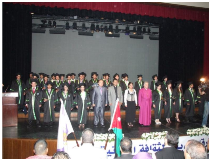
Saviour School, Zarka - Graduation